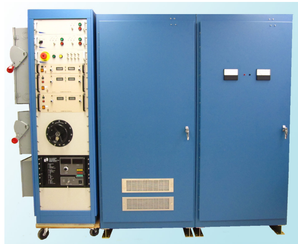
Figure 1. Switch Tube Test Set.

To satisfy this requirement, DTI developed and fabricated a test set system capable of supplying the electrical inputs required for the testing of multiple high power switch tubes (Fig. 1). The switch tube test set system operates under variable conditions (Table 1), and may be tuned to the particular requirements of different tubes. Table 2 (next page) describes the tubes which the pictured set may be configured to test; the testing of other tubes under load is possible for future units.