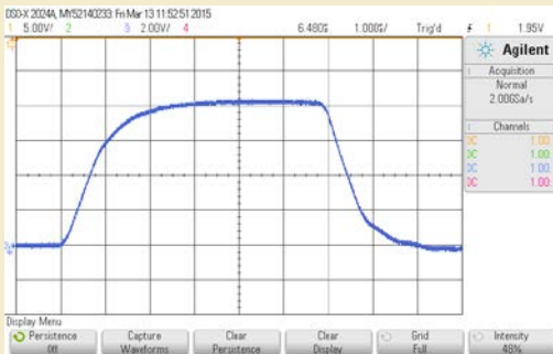
340 kV, 375 A Output Pulse from the klystron modulator system pictured above. This 3 \mu s pulse maintains voltage flatness to within 0.1% over 2.5 \mu s. Scale is 80 kV/div.

DTI's PowerMod™ short pulse modulator systems (pulsewidths of 1 - 500 microseconds) deliver MW peak power levels at frequencies ranging from UHF to W-band. Employing direct, transformer-coupled, and Marx-based solid-state switching topologies, PowerMod™ modulator systems offer improved performance and lifetime with: