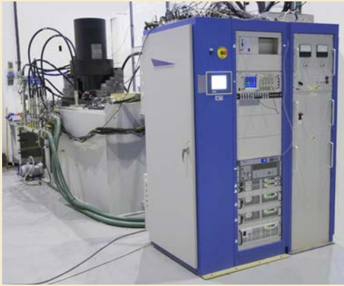
DTI High Power Klystron Modulator built for Daresbury Laboratory, UK. Controls and power supplies are contained in the cabinet on the right, while the tank on the left contains high voltage circuitry and pulse transformer.