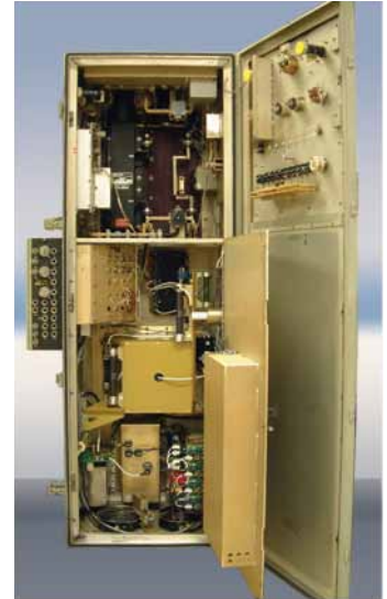
AN/SPQ-9A cabinet with the upgrade kit installed in the lower cabinet.

The new modulator interfaces with the transmitter using existing signals, and no changes to the Signal Data Processor or any of the remaining LRUs in the transmitter are required. Future modulators will be interchangeable between all systems with no adjustments or alignments required.