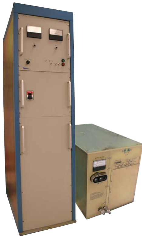
DTI's standard 200 kW Power Supply (left) and 300 kW Compact Power Supply (right) with 10 times greater power density.

DTI's 300 kW CPS was developed to power the US Navy Electromagnetic Railgun (EMRG) energy storage system under the Navy's Small Business Innovation Research Program (SBIR). Custom configurations are available for DC power or fast capacitor charging.