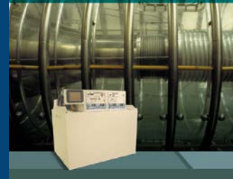
Advanced RF Systems